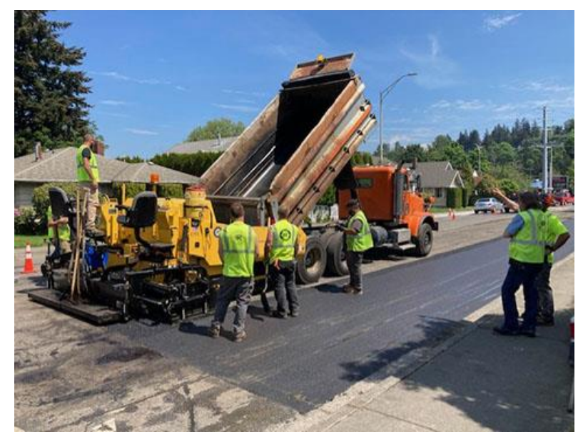
Road construction project at Hardie Avenue SW.